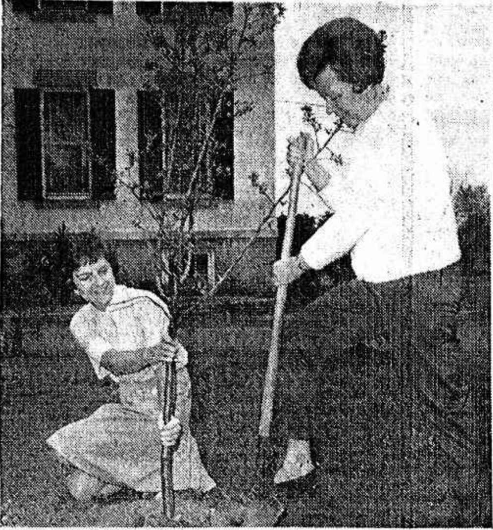
VILLAGE GETS GROOMING — Members of a Lewiston improvement organization, Femmes en Force (and husbands) rived television's soap and detergent giants Saturday with a